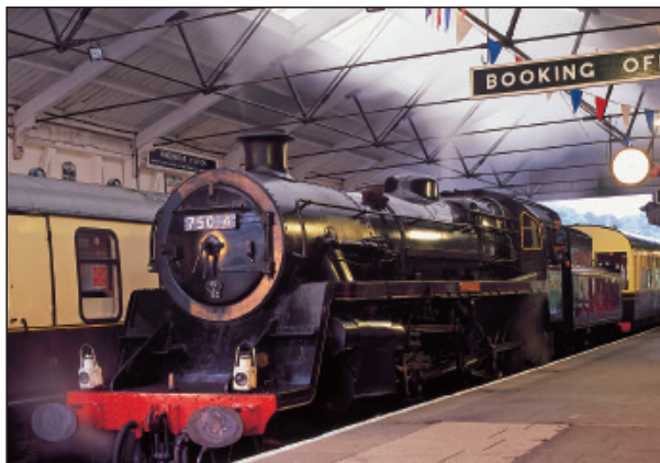
The overall roof at the buffer stop end of the station is a listed structure.