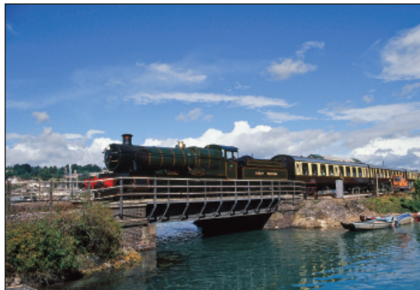
'Lydham Manor' crosses Waterhead Viaduct within sight of the station platforms.