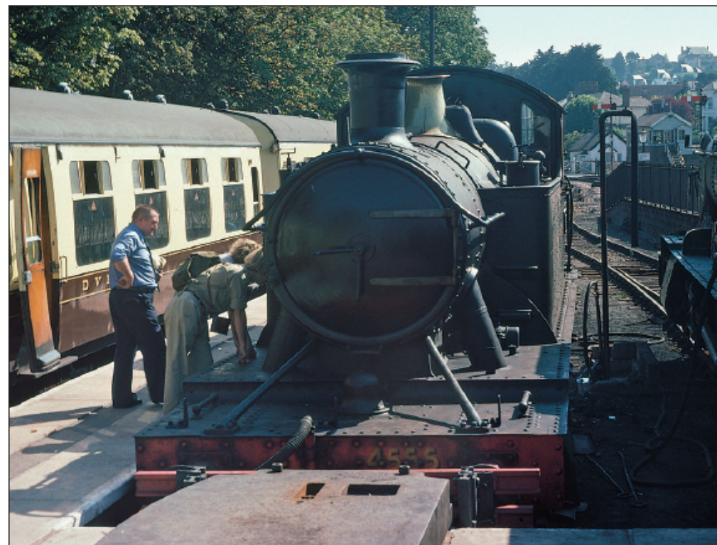
No. 4555 and 'Lydham Manor' attract attention at the Kingswear end of the platform.