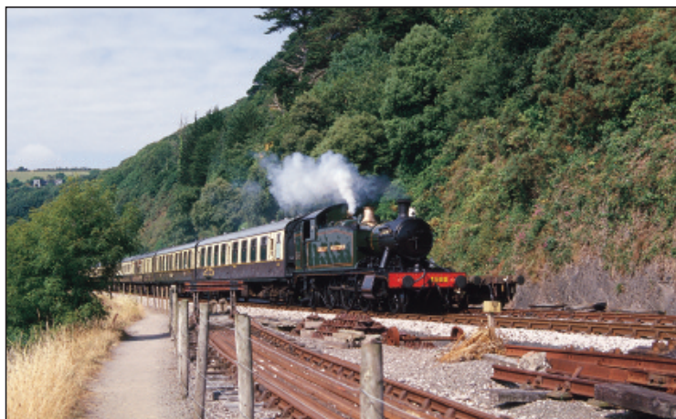
A popular Dart Valley Trail walk crosses the line a few hundred yards from the station necessitating a warning blast on the whistle from approaching locomotives.