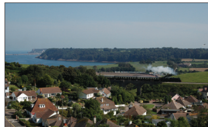
The railway begins to turn away from the coast and crosses over Broadsands Viaduct seen here from the main A379 Paignton to Brixham road.