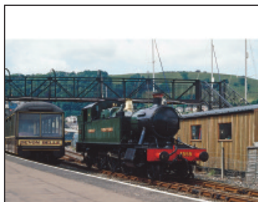
The 4555 (No. 250) and 4556 (No. 251) were built in 1900 for use on the main line. The 4555 (No. 250) was built by the Great Western Railway and the 4556 (No. 251) was built by the Great Western Railway. The 4555 (No. 250) was built by the Great Western Railway and the 4556 (No. 251) was built by the Great Western Railway.